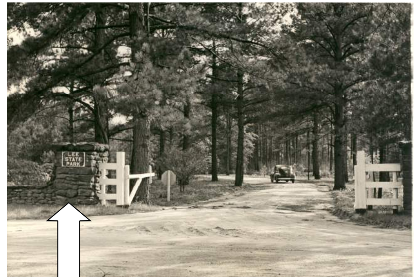
iron sandstone gate at park entrance, 1940s

The principle task assigned the men of Camp Lee was the development of the area as a state park. Although the park was not officially open to the public until June 1941, the public was permitted to use those completed facilities built by the CCC while the rest of the area was still under construction.