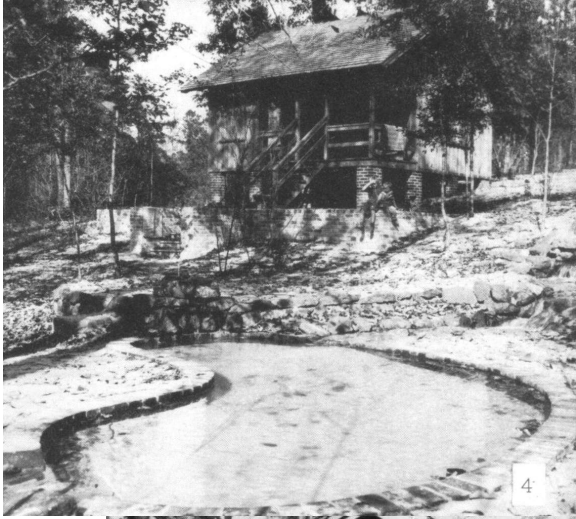
cabin and fish pool in primitive camping area, late 1930s